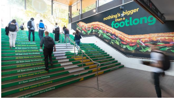
Best Use of Multi-Format Winner Campaign: Beyond Big Advertiser: Subway Creative agency: Publicis Team Fresh Media agency: Publicis Team Fresh Printer: GSP