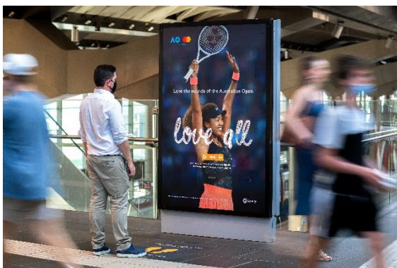
Innovation in Out of Home Honourable Mention Campaign: All Love – Australian Open Advertiser: Mastercard Creative agency: McCann Media agency: Carat Printer: Grand Print Services