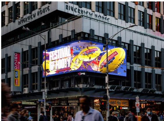
Innovation in Out of Home Winner Campaign: Festival of Footy 3DOOH Advertiser: AFL Creative agency: AFL & QUBE (QMS) Media agency: AFL Printer: NA