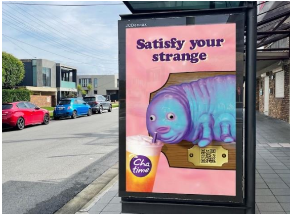
Best Use of Digital Winner Campaign: Satisfy your strange Advertiser: Chatime Creative agency: Special Group Australia Media agency: Love Media (OOH) & Wired Digital (Social) Printer: Cactus Imaging, De Signage & GSP